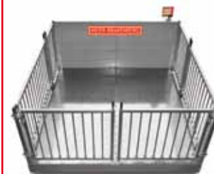
Three-way crossing at ramp