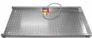
Weighing platform for 200 cows operation at the concentrated feed station