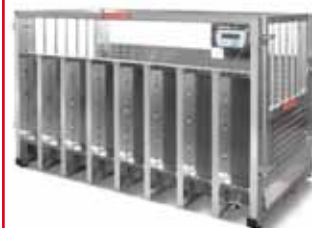
Bull scales for export weight control at Hamburg harbour