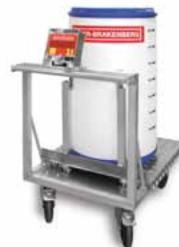
Barrel scales for chemical industry