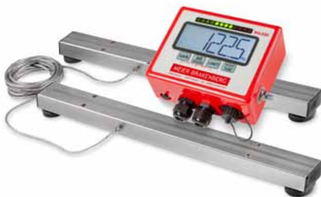
Balance beams from 100 cm in length can be shortened twice by 15 cm. Weighing beams up to 6 m long available on request.

To upgrade existing scales, we offer premium quality balance beams made of aluminium and stainless steel. The weighing electronics have an animal weighing program and the scale tares itself electronically. The weighing unit has waterproof load cells and is also protected against mice thanks to rodent resistant cables. Standard operation via mains adaptor can also be implemented with a battery.