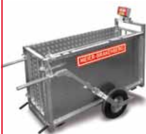
Wheel barrow type scales

develop concrete proposals and offer the ideal solution. When developing our products a high value is placed on premium quality materials and functionality!