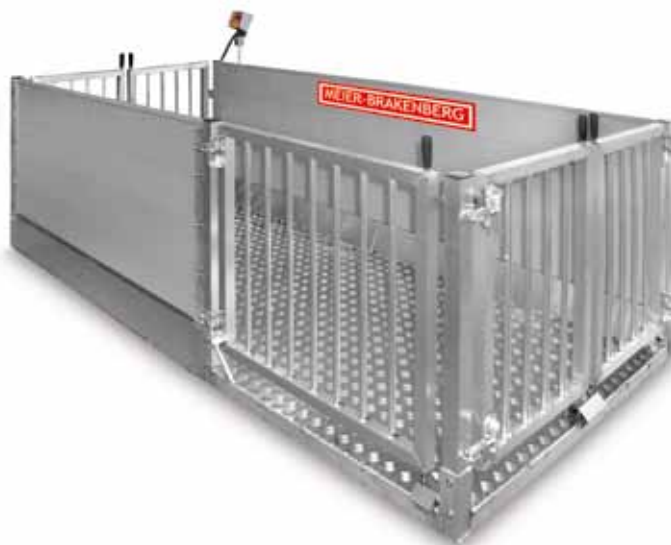
Stationary scales with extra side gate