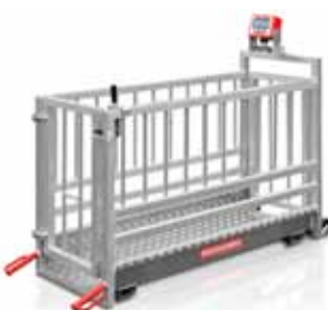
Sorting scales for gilt

Outer dimensions LxBxH (m): 1.75 x 0.58 x 1.10 Inner dimensions LxBxH (m): 1.42 x 0.47 x 0.90