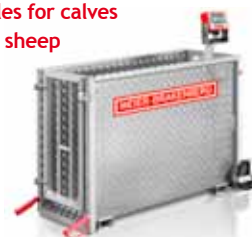
Scales for calves and sheep

Outside LxBxH (m): 1.50 x 0.76 x 1.10 Inside LxBxH (m): 1.22 x 0.47 x 0.90