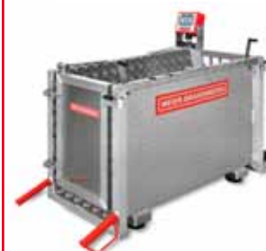
Mini piglet scales